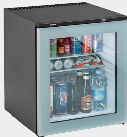
Eco-friendly, ultra-quiet and with an exclusive design.

K60 ECOSMART PV has a capacity of 60 liters. Reversible panel glass door. The internal cabinet has aluminum shelves. As for all ECOSMART compressor minibars, energy savings are guaranteed. The Ecosmart system allows you to reduce energy consumption and maximize the comfort of the guest in the room. The SNOOZE function also allows you to switch off the compressor (for 8 hours) by simply pressing the dedicated button located on the front of the minibar.