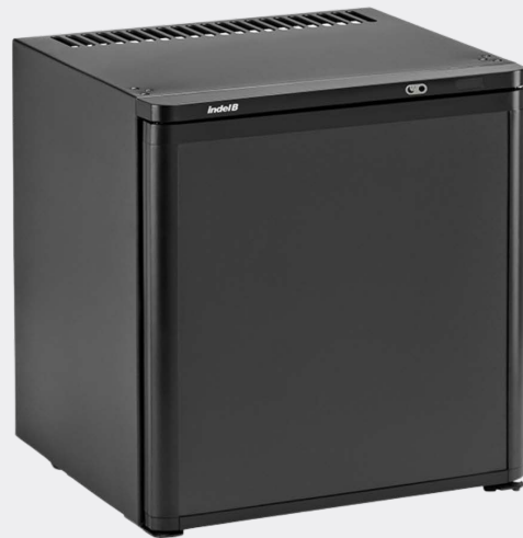
Eco-friendly, ultra-quiet and with an exclusive design.

K20 ECOSMART, with a capacity of 20 liters, has the possibility of reversing the door opening by inserting a panel, if desired. On request, a custom panel and a key lock can be fitted. The Ecosmart system allows you to reduce energy consumption and maximize the comfort of the guest in the room. The SNOOZE function also allows you to switch off the compressor (for 8 hours) by simply pressing the dedicated button located on the front of the minibar.