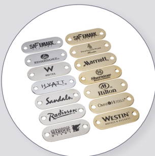
Custom Logo Plates (Available on Select Models)