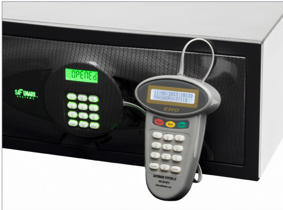
Emergency Handheld Override