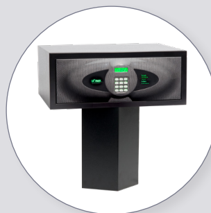
Color Matched Pedestals