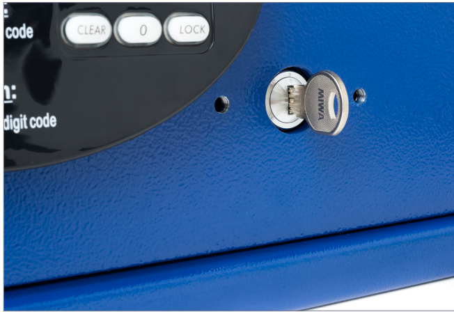
High Security Key Override*